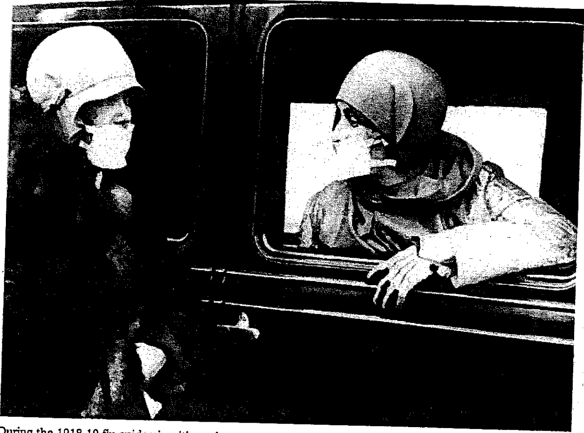
During the 1918-19 flu epidemic, citizens in many cities were required to wear masks at all times.