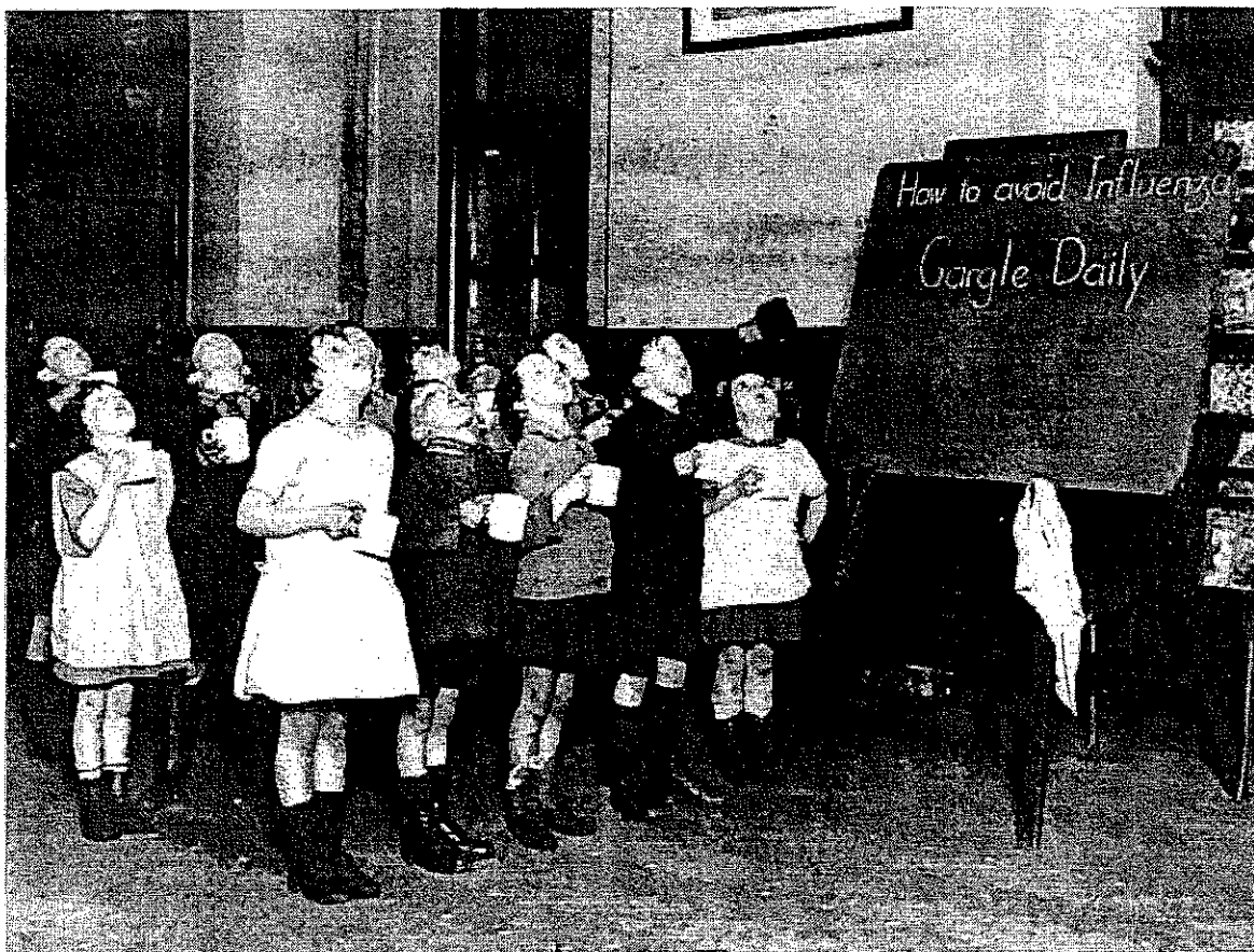
School children learning to gargle. Gargling was thought (incorrectly) to be one way to prevent influenza.