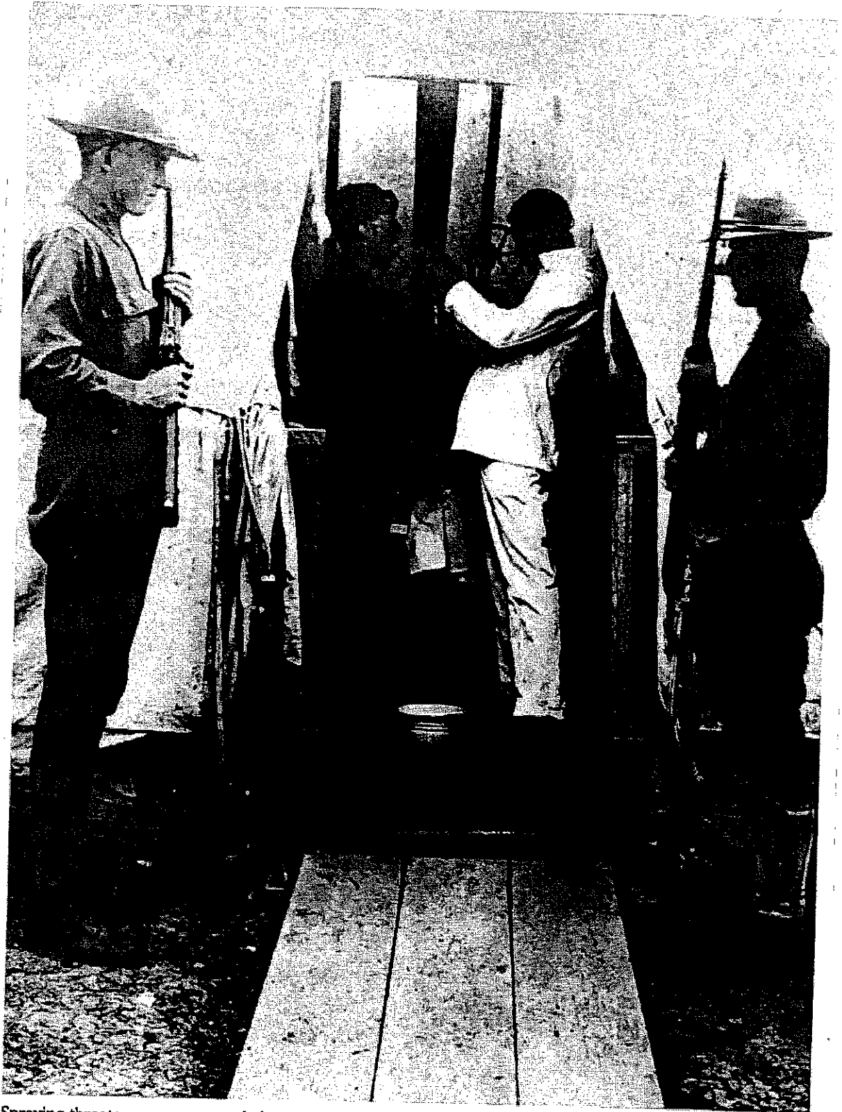
Spraying throats was recommended as a treatment to prevent Spanish flu.