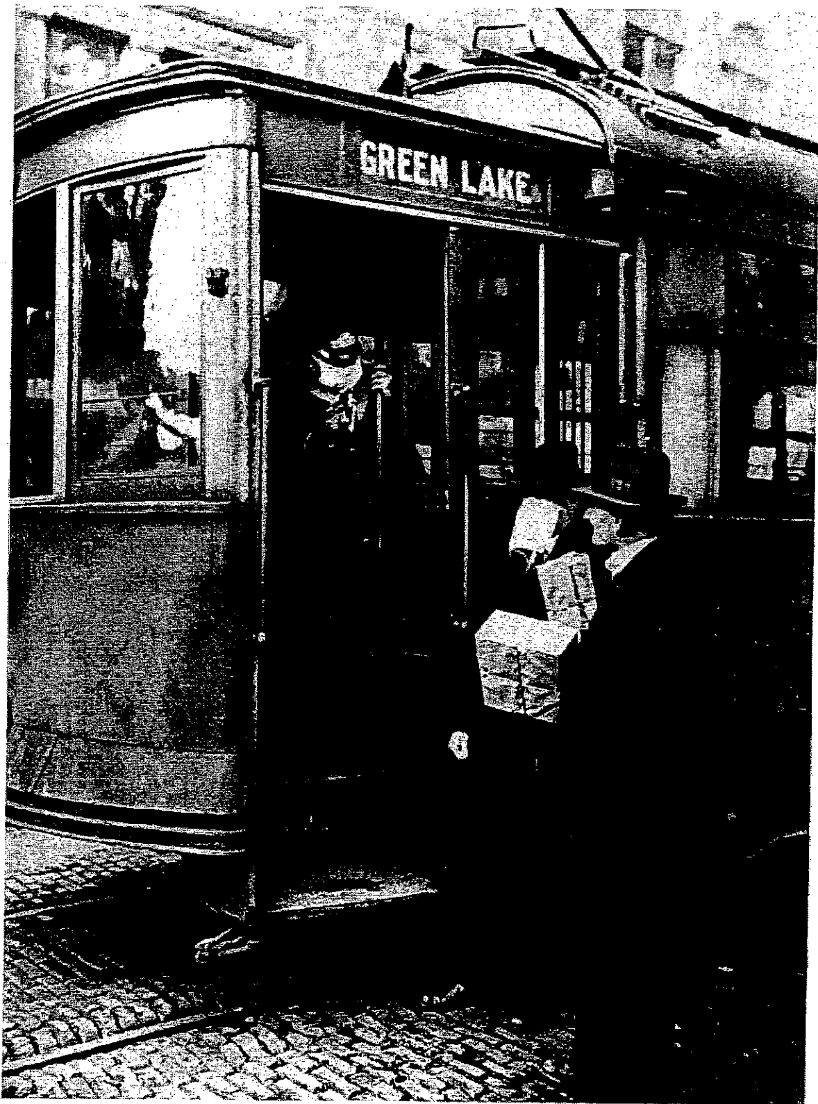
The conductor on a Seattle streetcar will not permit the man without a mask to board.